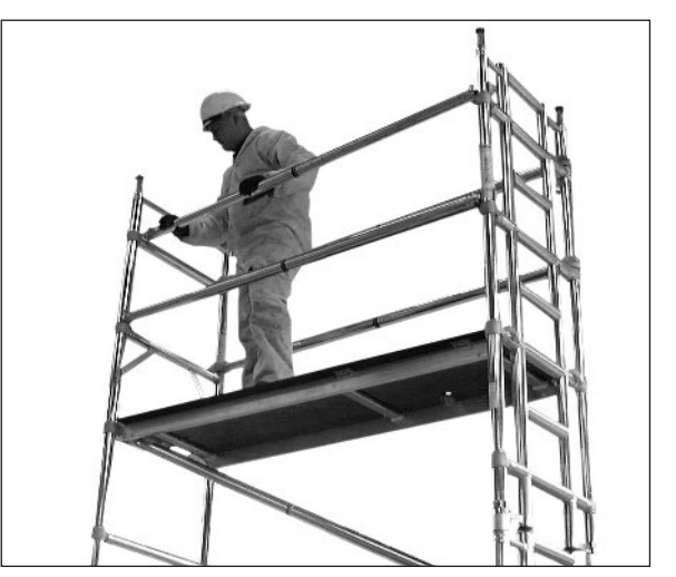
Dismantling is the reverse except when dismantling the handrail braces. Unclip the far end hooks and then from the sitting position through the trapdoor (3T) remove the handrails. Do not remove the handrails whilst standing on the platform, this would leave you at risk.