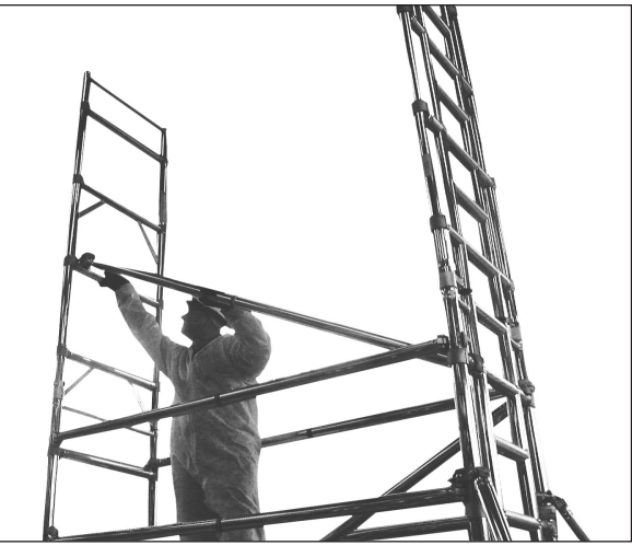
Klik in diagonal braces to continue in a regular pattern from rung to rung except when interrupted by an intermediate trapdoor platform.