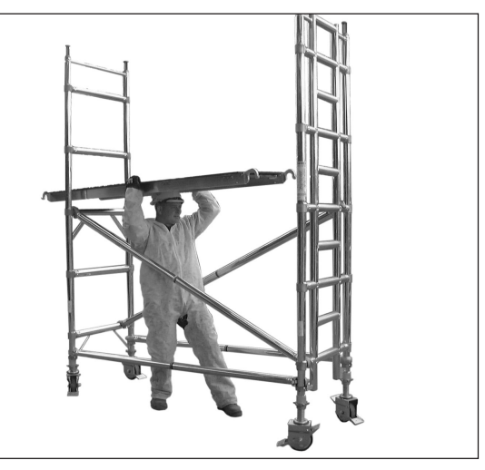
5 Fit trapdoor platform on appropriate rung, see tower illustration for guide. This will indicate which rung to fit trapdoor platform depending on final height.

Fit toeboards when handrails and mid rails have 13 been correctly fitted. For intermediate work, platforms, handrails, mid rails and toeboards must be fitted